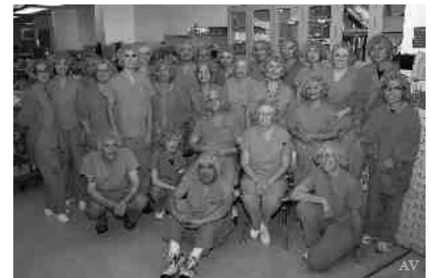
The Misericordia Sterile Processing Department Team