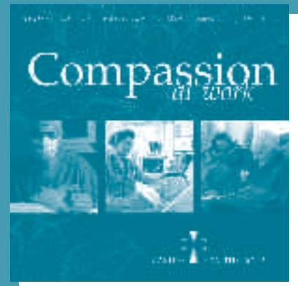
Compassion at Work DVD