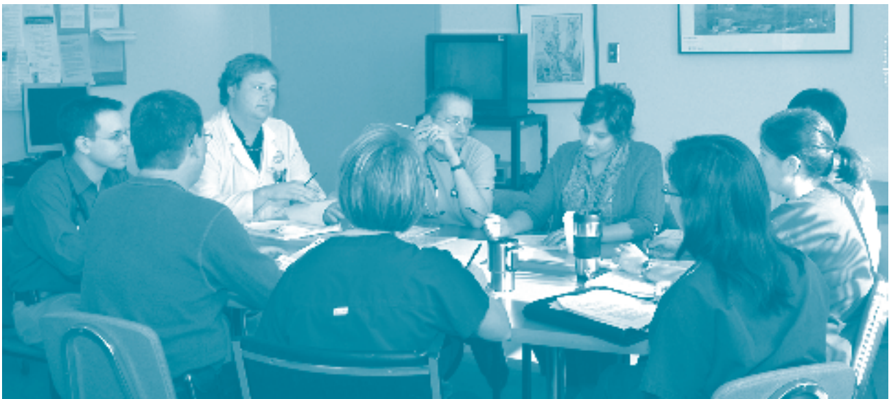
Members of the Blue Team in Family Practice meet to discuss the needs of their group of patients.