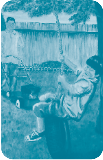
Generations - Cycles of Life painting