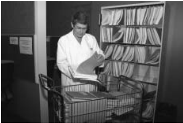
Health Records, Chart Review area, GNCH

Research requests are highly variable from just a few charts to thousands of charts. Last year, the health records departments at Caritas hospitals handled about 51 requests and pulled a total of approximately 1294 charts.