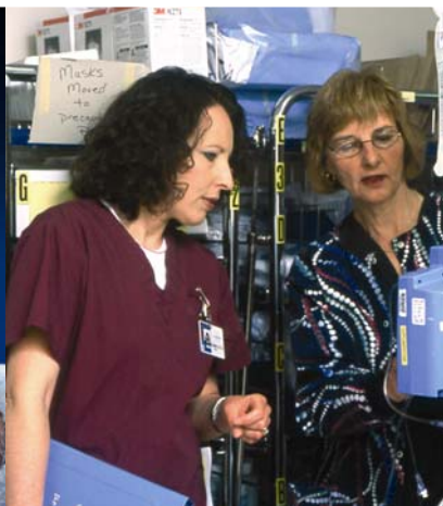
Healing the Body